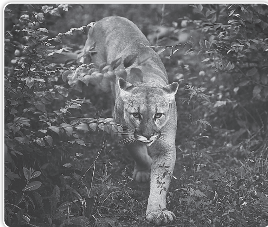
A puma walking in a forest